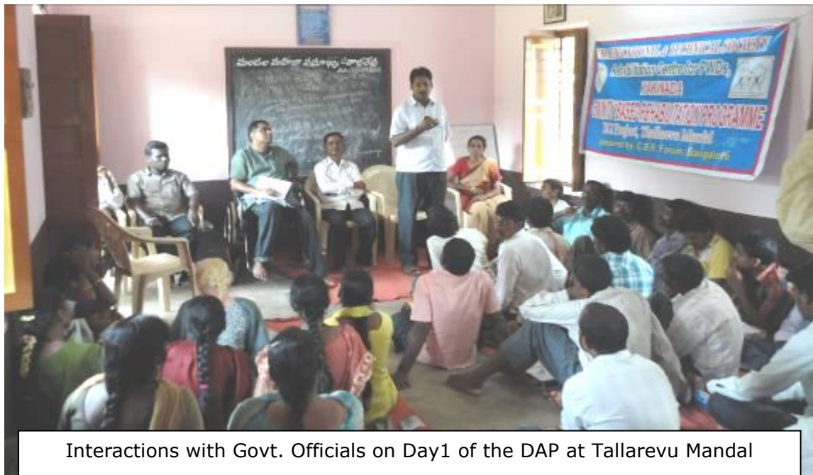
Interactions with Govt. Officials on Day1 of the DAP at Tallarevu Mandal