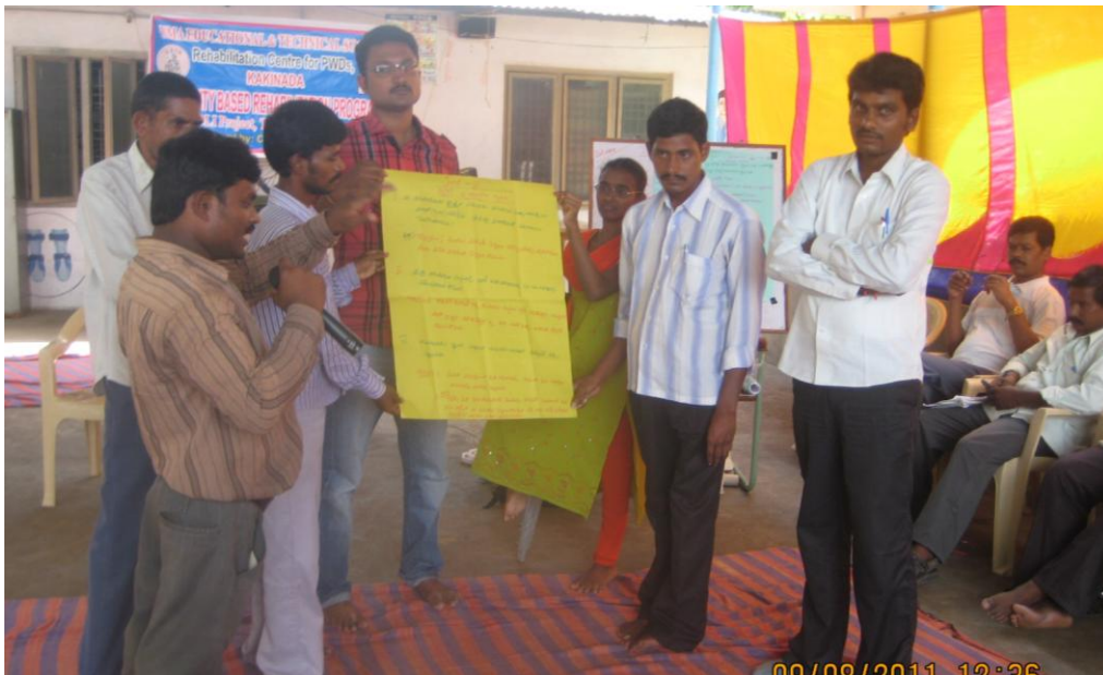
Presentation of the key advocacy actions in the coming 6 months